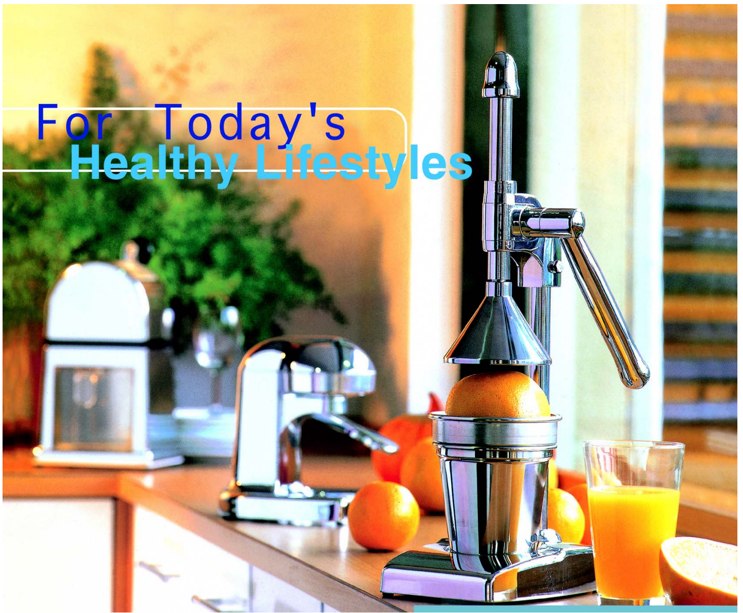
E T Hand Juicer